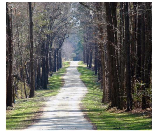
From top left to right, top to bottom: red shouldered hawk by Susan Heisey/USFWS; prothonotary warbler by Ken Jenkins; cypress trees in Cantey Bay by USFWS; alliquator by USFWS; pintail by USFWS; wildlife drive by Marc Epstein/USFWS