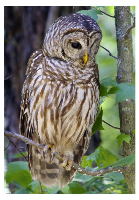
Barred owl by Woody Tilley

Unit), Black Bottom (Cuddo Unit), Savannah Branch (Pine Island), and refuge ponds and impoundments are closed to all access including fishing from November 1 – March 1 for migratory bird sanctuary. These areas produce largemouth bass, catfish, and bream. All Federal and State regulations are in effect. A free refuge fishing permit is required and must be in your possession while fishing on the refuge.