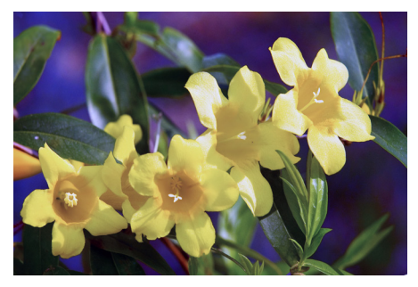
Yellow jasmine

Layered clothing during cool months and the use of insect repellant during warm months are recommended.