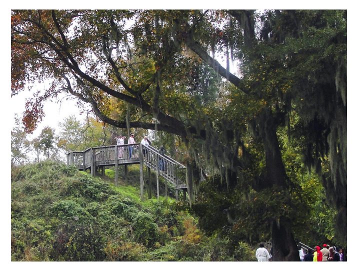
Indian mound by USFWS