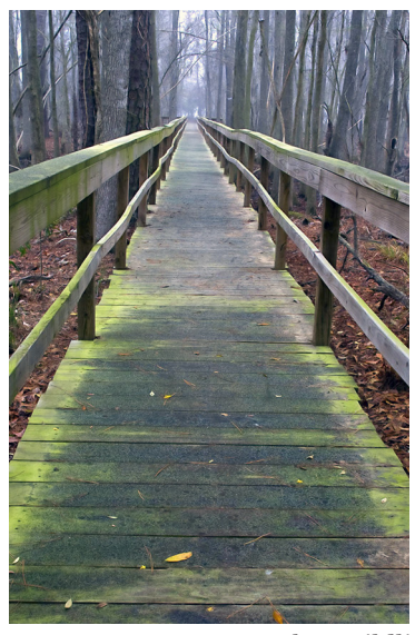
wood ducks, and small mammals. An observation platform on the east side of this trail is a great place to see wading birds, Canada geese, and other waterfowl species in Cantey Bay.

A walk along the one-mile Wrights Bluff Nature Trail affords visitors the chance to observe songbirds,