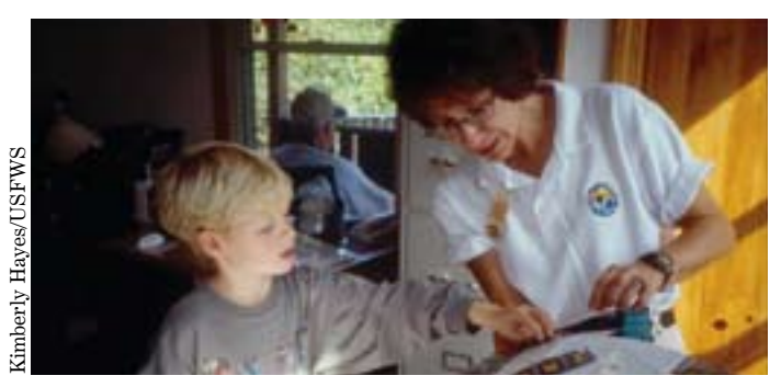
Volunteers provide assistance in numerous ways.