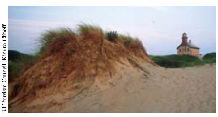
Northlight Block Island