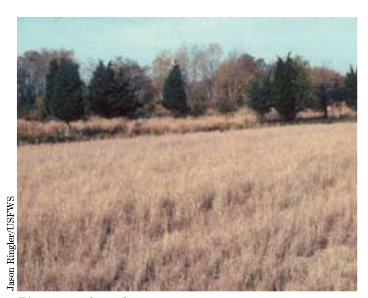
Five acres planted 1998