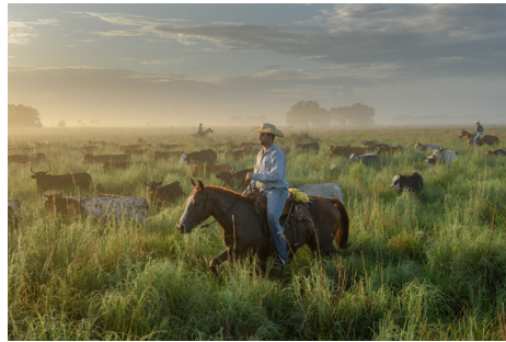
Working ranchhands.

The Service conducted public scoping in March and April of 2023 regarding the purpose and need for the Service to engage in conservation protection within southwest Florida. Over 2,600 comments were received on the concept of the Service potentially establishing a conservation area to protect ecological priorities within a wildlife corridor expanding from Florida Panther National Wildlife Refuge and Big Cypress National Preserve north of the Caloosahatchee River to Everglades Headwaters National Wildlife Refuge and Conservation Area. This concept was based on an LCD completed in July of