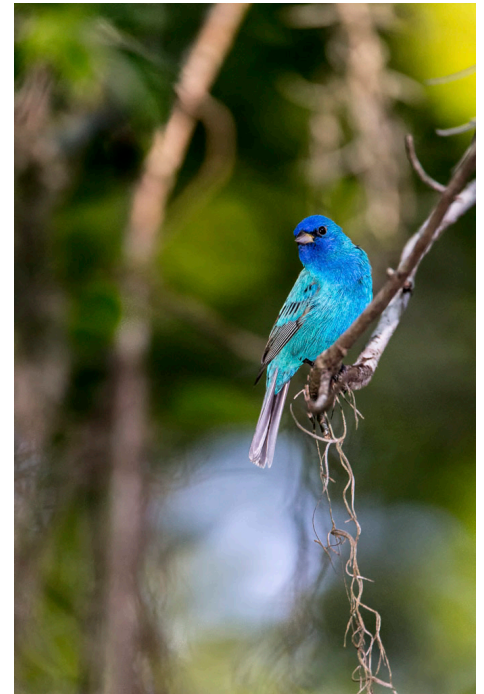
Indigo bunting.

Lands in which the Service purchases fee-title from willing sellers, could be open for compatible public recreational uses such as hunting, fishing, wildlife observation, photography, environmental education, and interpretation and could provide cultural, traditional, and medicinal use opportunities for Tribal nations. The total amount of fee-title acres purchased by the Service can not exceed 10% of the proposed Conservation Area's total acreage. Details of the proposal, including maps, are available as part of the Draft Planning Package which can be found at https://www.fws.gov/project/everglades-to-gulf-conservation-area .