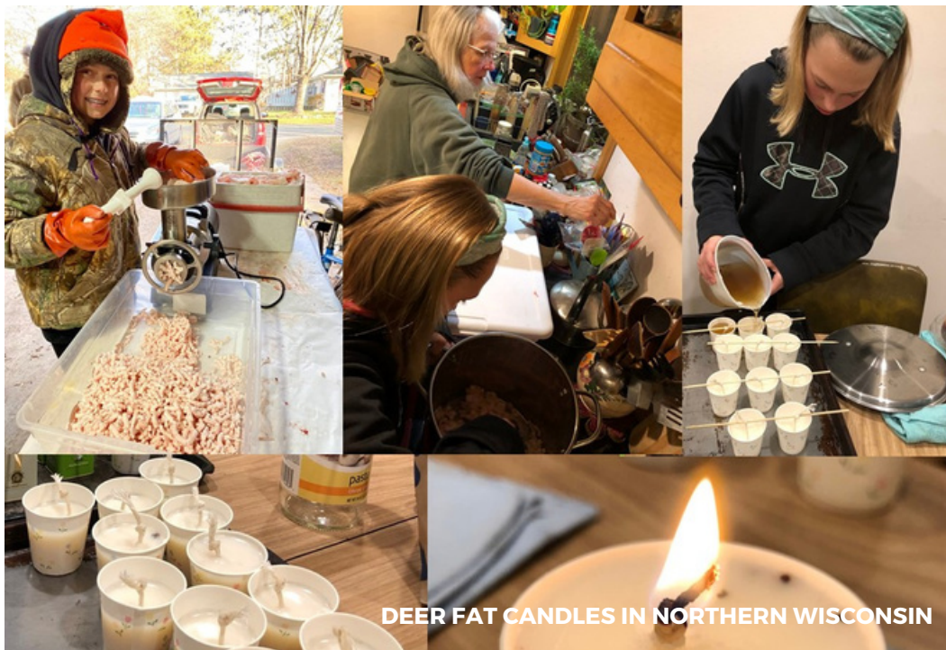
DEER FAT CANDLES IN NORTHERN WISCONSIN