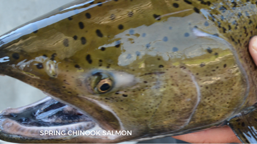
SPRING CHINOOK SALMON