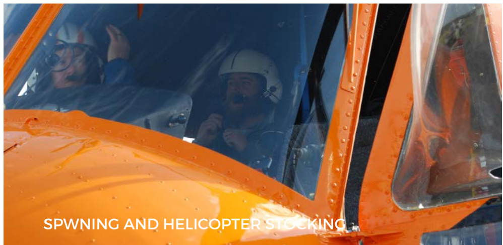
SPWNING AND HELICOPTER STOCKING