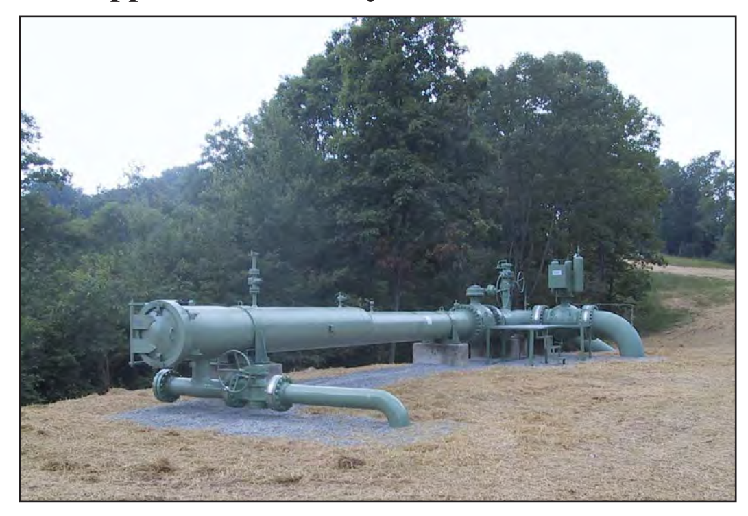
Appurtenant Facility: Compressor Station