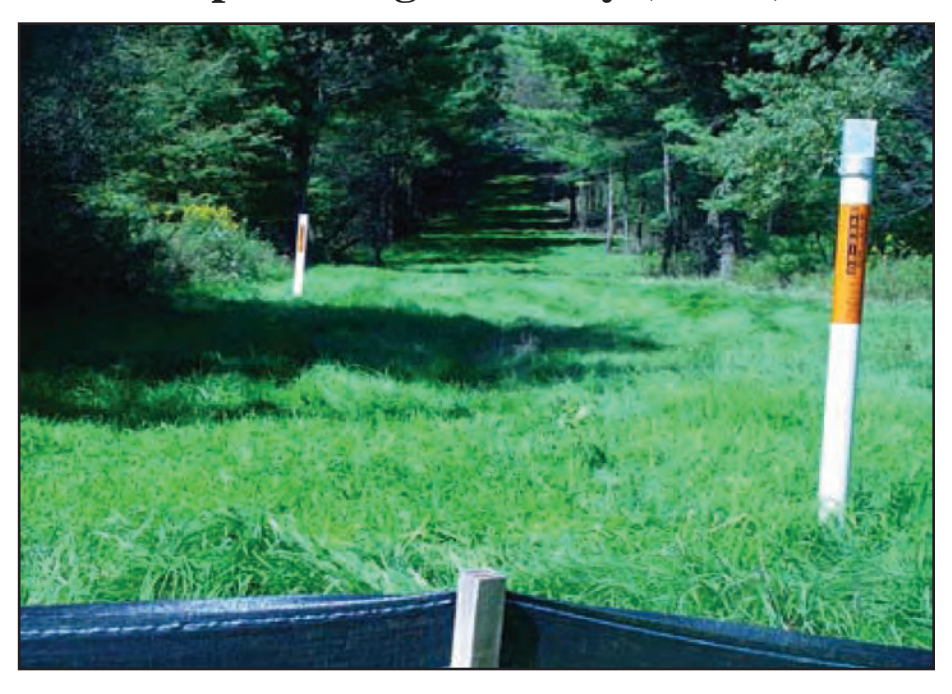
Appurtenant Facility: Valve Set