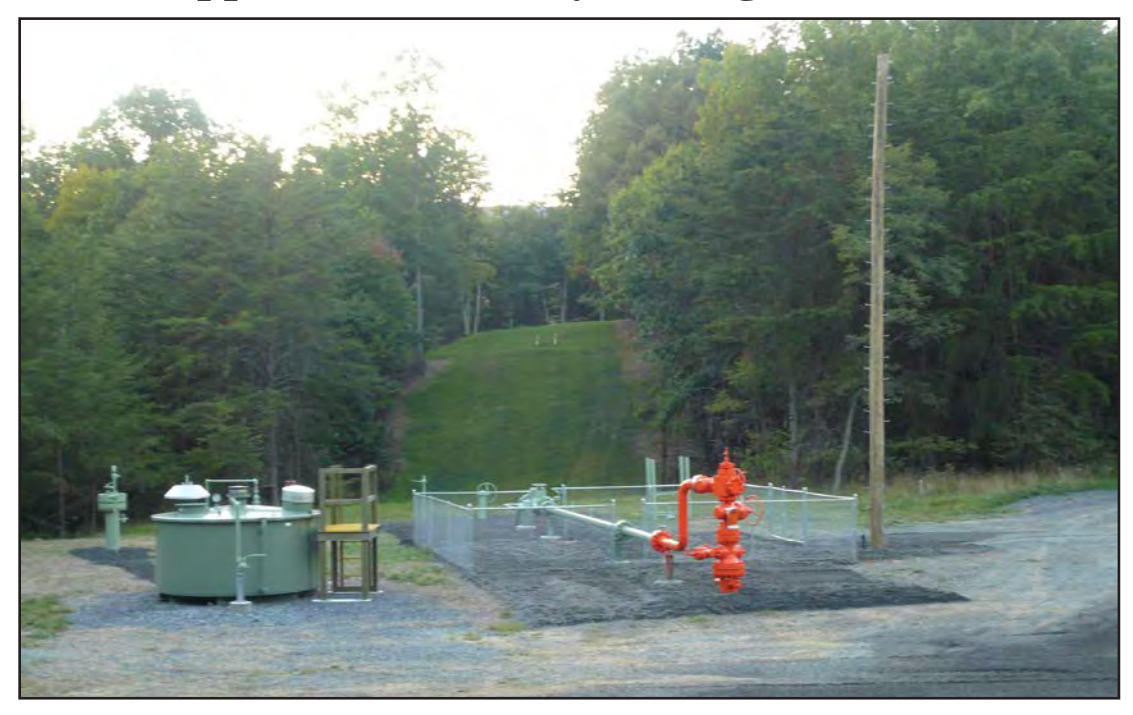
Appurtenant Facility : Communication Site