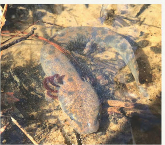
Notice the Neuse River waterdog's cylindrical body with bright red external gills, and flat (lataterally comppressed) tail.