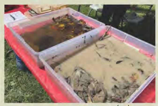
The picture above show preferable (left) and undesirable (right) water quality for waterdogs.

These threats also make it difficult to breathe using their external gills.