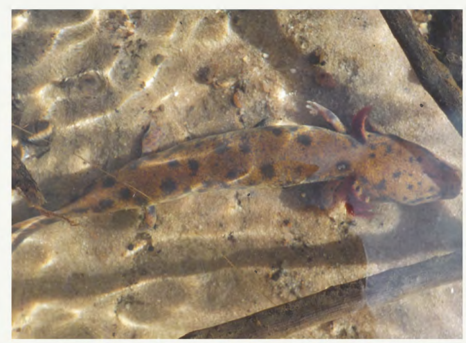
Neuse River waterdog underwater, blending into its surroundings with its brown body and dark brown/black spots covering its back.

The Neuse River Waterdoa (Necturus lewisi) is a permanently aquatic salamander. This means they only live in the water and they keep their external gills into adulthood, which is unlike most other salamanders.