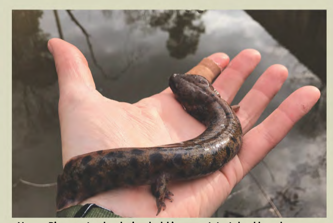
Neuse River waterdog being held in an outstretched hand.

If you have any questions, please contact the Pacifici Quantitative Ecology Lab at jkpacifi@ncsu.edu