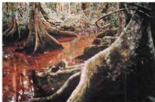
Figure 1. Bloodwood trees at Pterocarpus Forest near Humacao, Puerto Rico.

In Puerto Rico, the Lacustrine and Riverine Systems consist largely of deepwater habitats. Lacustrine wetlands are limited to shallow areas of lakes and reservoirs. Riverine wetlands are limited to the shallows of river channels and canals. Where the stream current is swift, these wetland areas typically are nonvegetated. When vegetated, lacustrine and riverine wetlands generally are characterized by plants that grow in aquatic beds on or below the surface of the water. Some of the more common plants in these wetlands