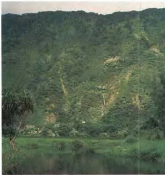
Figure 1. Estuarine wetland in Waimanu Valley on the island of Hawaii.

Wetlands can improve water quality (Hemond and Benoit, 1988) and reduce flooding (Carter, 1986). Wetlands in Pearl Harbor are being considered for use as sediment traps by the U.S. Navy (Stephanie Aschmann, U.S. Navy, oral commun., 1992). The Kawainui Marsh is an example of a wetland managed for flood protection.