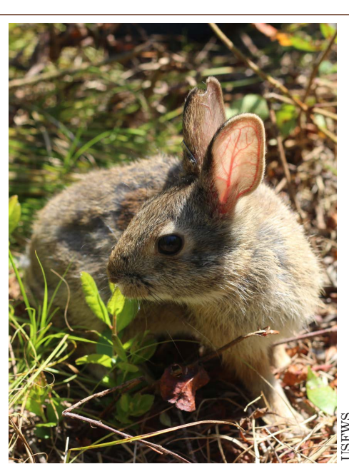
More than 130 rabbits have been raised in several locations and later released.

Unlike the eastern cottontail, New England cottontails rely exclusively on young forests and shrublands (earlysuccessional habitats). These habitats are often associated with abandoned agricultural lands, wetlands, clearcuts of woodlands, coastal shrublands, scrub