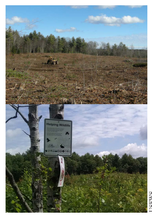
A clear cut may look unsightly to people for a few years, but it's a welcome sight and life-sustaining home for wildlife. This photo shows a farm following the cut and then one year later.