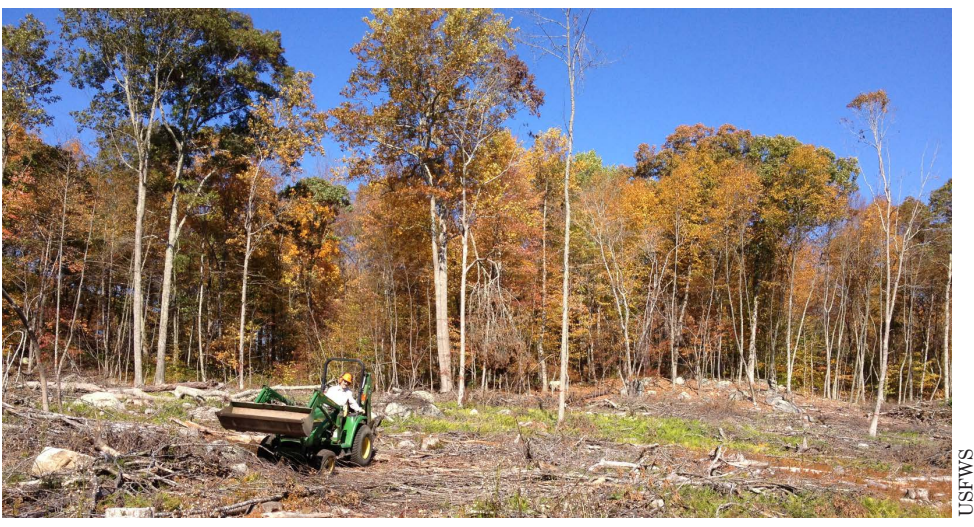
Experts use heavy machinery to harvest trees and cut back shrubs, and they conduct controlled burns that foster young forest growth. Additionally, partners and volunteers have planted shrubs and created cottontail burrows to speed up the process.

in Scotland, Connecticut, in 2007 led to New England cottontails moving in by 2014. Tree clearing at Stonyfield Yogurt's plant in 2008 in Londonderry, New Hampshire, resulted in a manyfold increase of the site's population. Additionally, for the first time in history, New England cottontails were bred and raised in captivity.