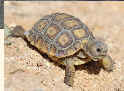
Juvenile Mojave desert tortoise.