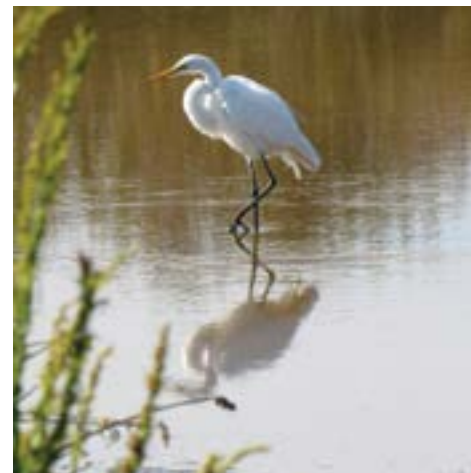
Great egret.