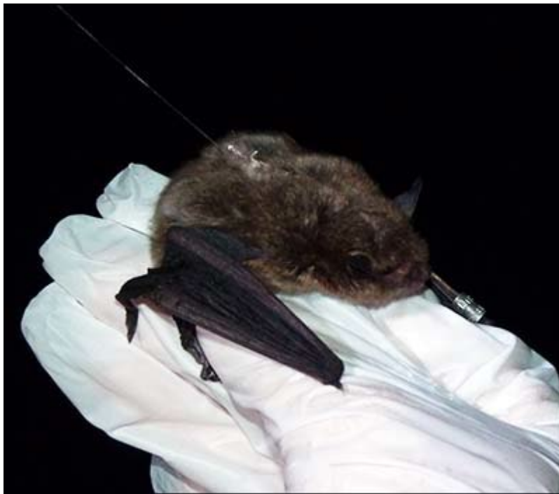
The U.S. Fish and Wildlife Service is working with the wind energy industry to minimize mortality of Indiana bats, an endangered species.

Above and beyond the services that can be assigned an economic value, bats provide cultural benefits ... well known to those who enjoy watching the silhouette of a bat against the night sky. The challenge before us is to work with the wind industry and other partners to provide for both sustainable wind energy development and sustainable bat populations.