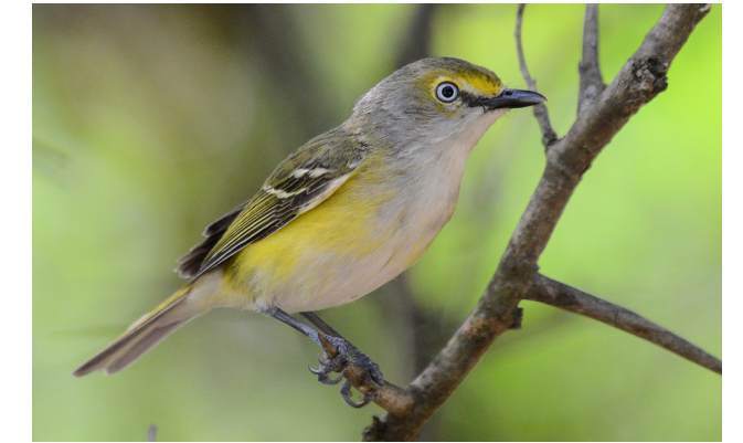
White-eyed vireo.