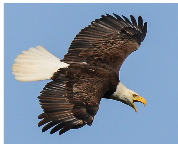
Left, White pelican. Right, Bald eagle.