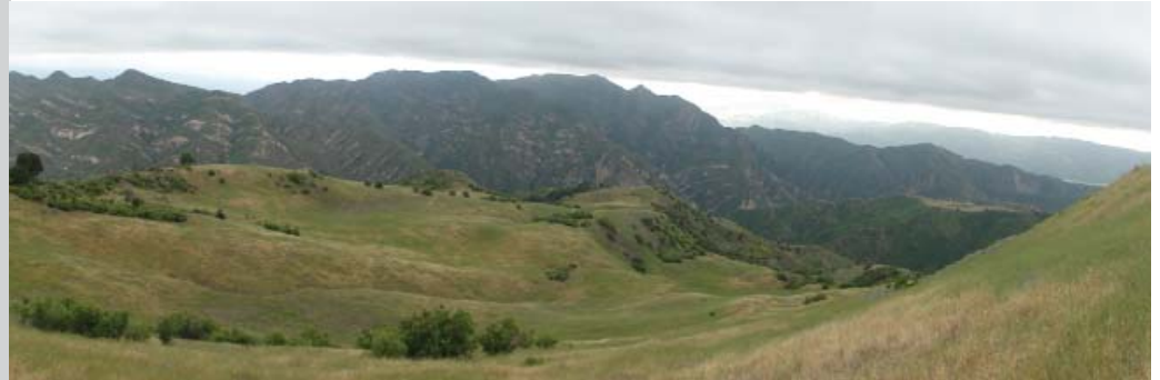
Hopper Mountain National Wildlife Refuge.