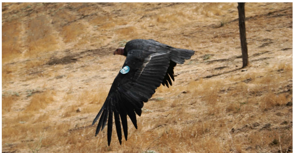
California condor at Bitter Creek NWR.

California condors circle the skies above, while below, the Bitter Creek National Wildlife Refuge landscapes showcase conservation in action. As a hub of condor activity and research opportunities, Bitter Creek National