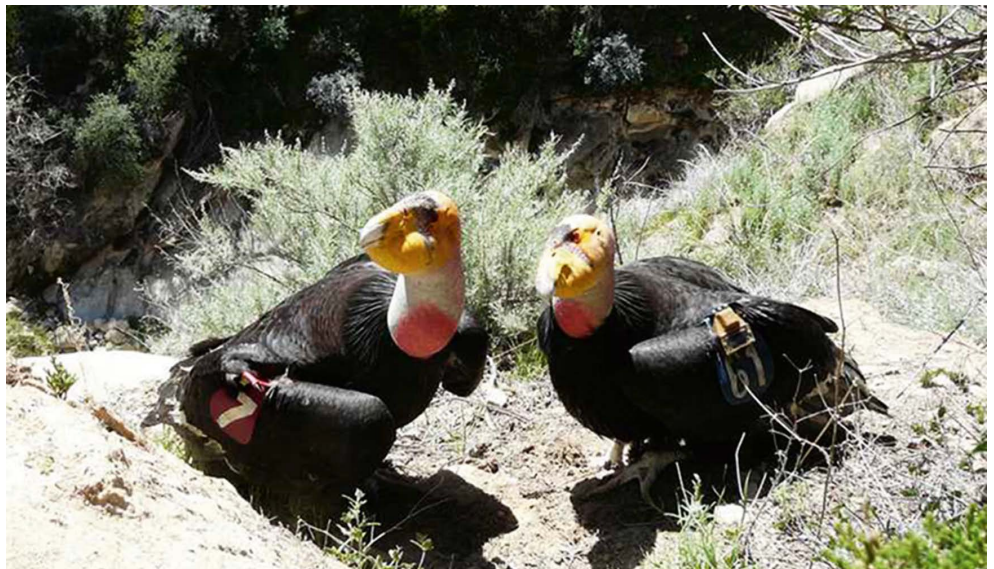
A pair of condors at Hopper Mountain NWR.