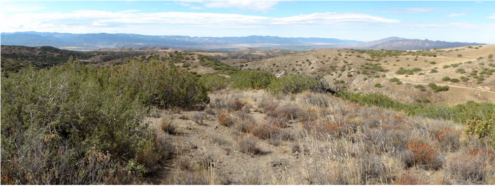
Juniper woodland at Bitter Creek NWR.

Wildlife Refuge is a unique keystone at the nexus of two mountain ranges encompassing much of the historical California condor range and serving as an important wildlife corridor. The Refuge protects habitat within an important east/west running mountain range and provides movement corridors for populations of native ungulates, raptors and other wildlife. Condor and other wildlife movements extend beyond Refuge boundaries and exemplify the U.S. Fish and Wildlife Service's contribution to a much larger conservation initiative as we partner with public and private land owners. Alongside these charismatic animals, so too can lesser known and rare wildlife and plant species thrive within this intact and functioning ecosystem. Also protected on the Refuge are Native American cultural resources and remnants of 19th century homesteads.