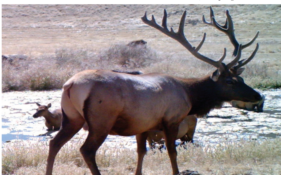
Tule elk at Bitter Creek National Wildlife Refuge

Several responses from individuals and organizations emphasized the negative impacts of grazing and stated that overgrazing was a major concern. A few comments enumerated the effects of previous overgrazing on the refuge, including habitat degradation, stream bank erosion, introduction and spread of invasive species, diminished plant diversity, disruption of native wildlife, trampling and con-