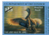
Migratory Bird Hunting and Conservation Stamp, also known as the Duck Stamp

Wildlife Service. This system is a network of lands and waters managed specifically to protect wildlife and wildlife habitat. It represents the most comprehensive wildlife management program in the world. Units of the system stretch across the United States from northern Alaska to the Florida Keys and include small islands in the Caribbean and South Pacific. The character of each refuge is as diverse as the nation itself.