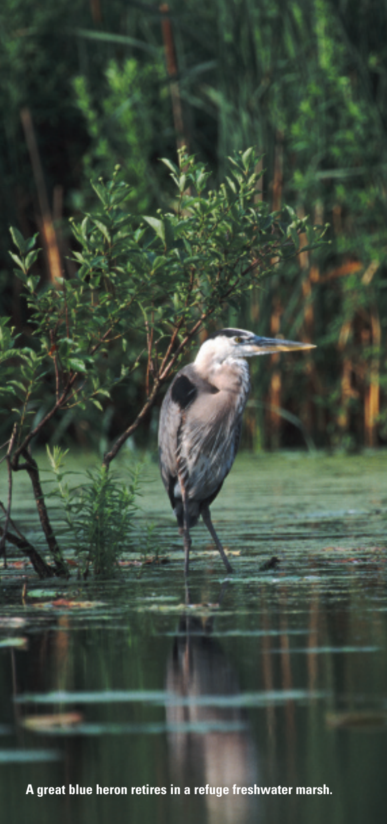
A great blue heron retires in a refuge freshwater marsh.