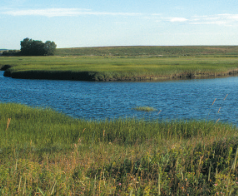
Unspoiled scenery adds to the pleasure of a refuge visit.