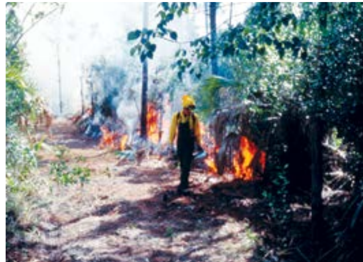
Pinelands and prescribed burn

Crocodile Lake NWR, located in North Key Largo, was established in 1980 to protect and preserve critical habitat for the endangered American crocodile. The mangrove wetlands of the