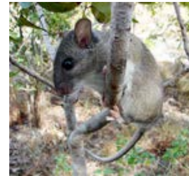
Key Largo woodrat/Clay DeGayner

These forests are home to several endangered and threatened species including the Key Largo woodrat, Key Largo cotton mouse, Schaus swallowtail butterfly, Eastern indigo snake and Stock Island tree snail. Hardwood hammocks also provide important seasonal habitat for migratory neotropical songbirds and permanent homes to colorful tree snails and butterflies.