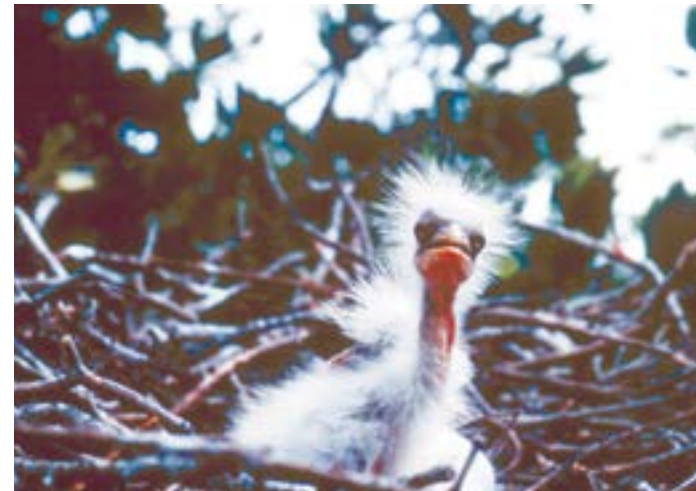
Great white heron chick

Due to the small size of the refuge and sensitivity of the habitat