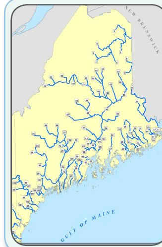
Figure 3 – Gulf of Maine. Many rivers in Maine were home to Atlantic salmon. Today, there are many obstacles that make it hard for them to use some of these rivers.