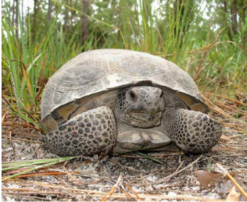
The forelimbs of the gopher tortoise are shovel-like, with claws used for digging burrows.