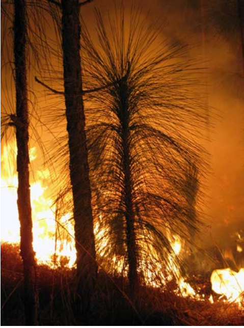
Fire is an integral part of the longleaf ecosystem.