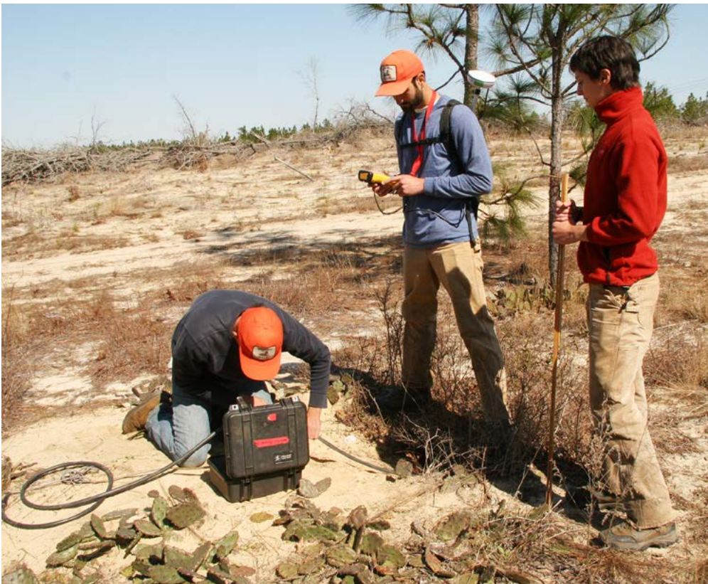
A survey team from The Joseph W. Jones Ecological Research Center at Ichauway locates a gopher tortoise burrow on a privately owned tree farm in south-central Georgia. A camera scope is used to determine if the burrow is occupied by a tortoise.