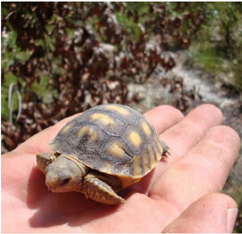
Female gopher tortoises lay about four to 10 eggs per clutch, and incubation lasts 85 to 100 days. This juvenile was found on state land in south Georgia during a survey in 2012.

A wide variety of information is available on the number and density of gopher tortoises and their burrows throughout their range. These data are the result of numerous surveys using a variety of methods ranging from one-time population counts to repeated surveys over several decades. The diversity of data poses a challenge when trying to evaluate the status of a species from a range-wide perspective. For example, in geographic areas where there is more data, the Service has higher confidence in drawing conclusions about the status of the population. In other areas, where there is little or no data, the Service's confidence in assessing the status of tortoises is lower.