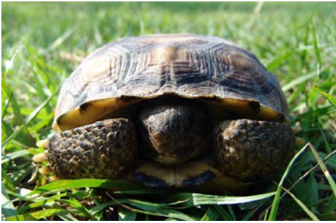
Gopher tortoises can live 50 to 80 years.

In the gopher tortoise's western range, the Recovery Plan (USFWS 1990) defines reasonable actions needed to recover the species. Some of those described actions include additional surveys and monitoring; management of habitat and tortoise populations on private and public lands; curbing harvest by humans; and increasing research on topics such as genetics, population viability, and barriers to reproduction.