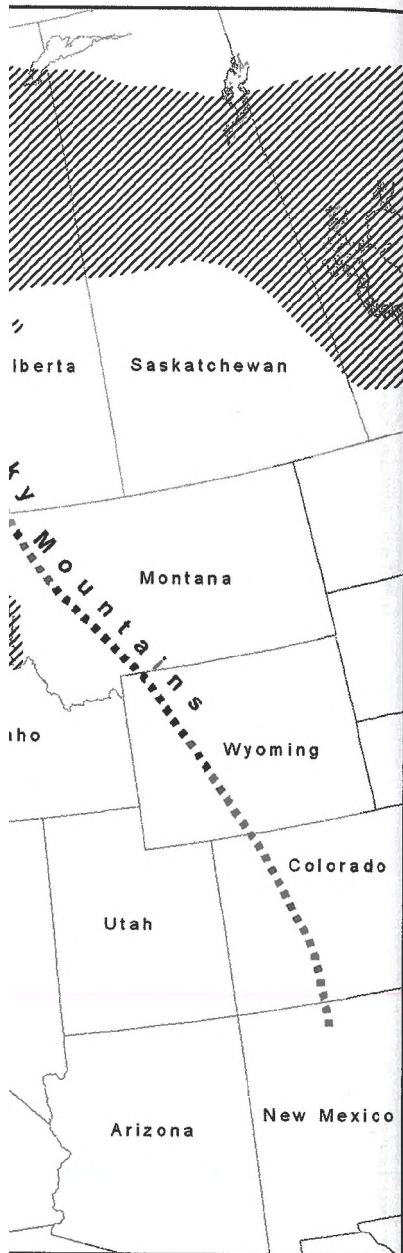
of information on fisher habitat ecology me sources generated information for ies to British Columbia, Oregon, and ers is based on Lofroth et al. (2010).

(M. Schwartz, USDA Forest Service, personal communication), were completed, but the results were not available at this time.