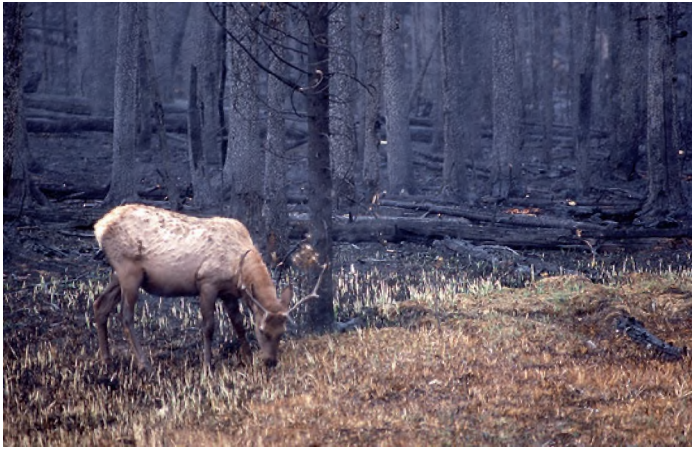
Fig. 8.4 Ungulates generally respond positively to wildfires that create patchy habitat with improved forage, as shown in this photo of an elk browsing in a recently burned lodgepole pine forest

during winter, although in warmer climates, thermal cover reduces daytime heating.