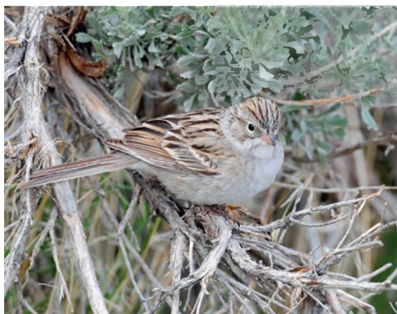
Fig. 8.5 Sagebrush-obligate species such as Brewer's sparrow (shown here) may have less nesting habitat in the future if the extent of mature sagebrush habitat is reduced by wildfire

Brewer's sparrow is a sagebrush obligate during the nesting period, preferring tall, dense stands of sagebrush (Fig. 8.5). In many areas, Brewer's sparrows are the most abundant bird species (Norvell et al. 2014). The obligate relationship of Brewer's sparrow with sagebrush lacks causal explanations (Petersen and Best 1985). Therefore, correlative associations can be used to project climate change effects, but