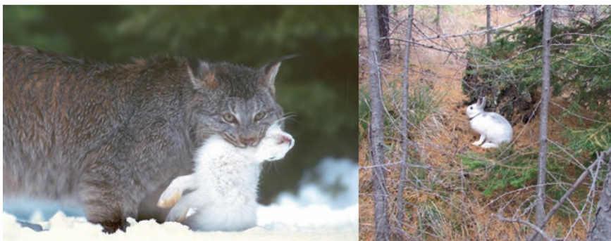
Fig. 8.2 Canada lynx diet is dominated by snowshoe hare, which undergoes seasonal pelage change from brown to white. The effectiveness of this strategy depends on synchrony with snow cover

Ectotherms (cold-blooded animals), which include fish, reptiles, and amphibians, react not by feeling cold and metabolizing energy to maintain core temperature, but by having their metabolism slow until their activity is reduced, in some cases becoming torpid. These basic metabolic differences in vertebrates must be considered in how climate change will interact with animal life history, spatial distribution, habitat quality, and food sources.