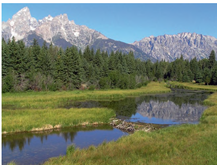
Fig. 8.3 Restoration of American beaver populations helps maintain cool water in mountain landscapes. Beavers create structures that help ameliorate the effects of climate change on habitat for cold-water fish species and other aquatic organisms

Climate can indirectly influence beavers through effects on vegetation. Climate change and climate-driven changes in streamflow may reduce early-seral tree