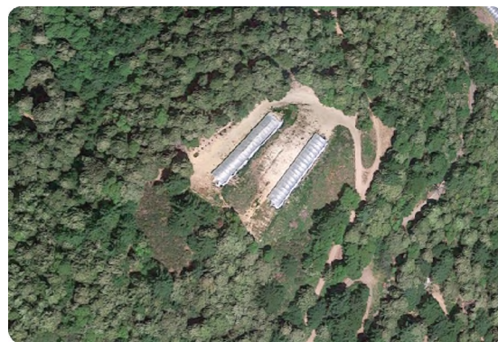
Google Earth view of a grow in Humboldt County.

State officials are taking steps to address these issues. Last year, the State Water Resources Control Board issued Best Management Practices for mitigating water pollution from cannabis cultivation activities. In addition, Governor Brown signed three bills