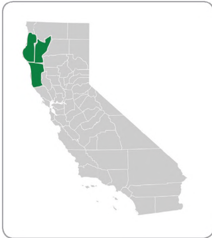
The Emerald Triangle is made up of Humboldt, Mendocino and Trinity counties.

tion, unregulated road construction, landslides, erosion, clogging of streams with dislodged soil, poisoning and poaching of wildlife, and drying up and polluting of streams and rivers. Many trespass cultivation sites are large repositories of trash, including plastic hoses, fuels, pesticides, fertilizers, and food and human waste. Many growers import large quantities of compost which are dumped after a year or two, causing destructive levels of nutrients to pollute rivers and streams.