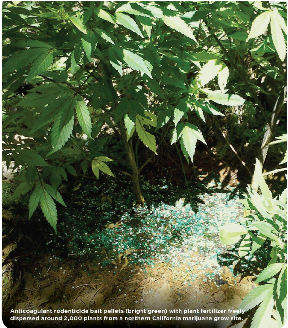
Anticoagulant rodenticide bait pellets (bright green) with plant fertilizer freely dispersed around 2,000 plants from a northern California marijuana grow site.