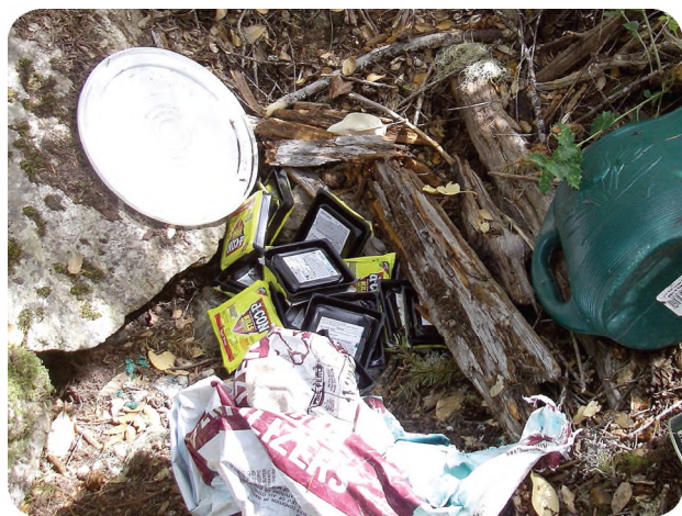
Multiple packets of anticoagulant rodenticides found surrounding an illegal marijuana grow site in Northern California.

On November 8, 2016, California voters approved a measure legalizing marijuana for adult use. It imposes extensive controls and regulation. This Act identifies the environmental concerns and contains strong provisions and funding for protection, enforcement and remediation of damages. Regulation of this industry will provide clear enforcement authority and resources for state and local agencies. Land trusts must follow and understand the regulations that develop at both a state and local level, as well as prepare to address issues of cultivation on current or future protected lands and easements as marijuana cultivation enters the light of day.