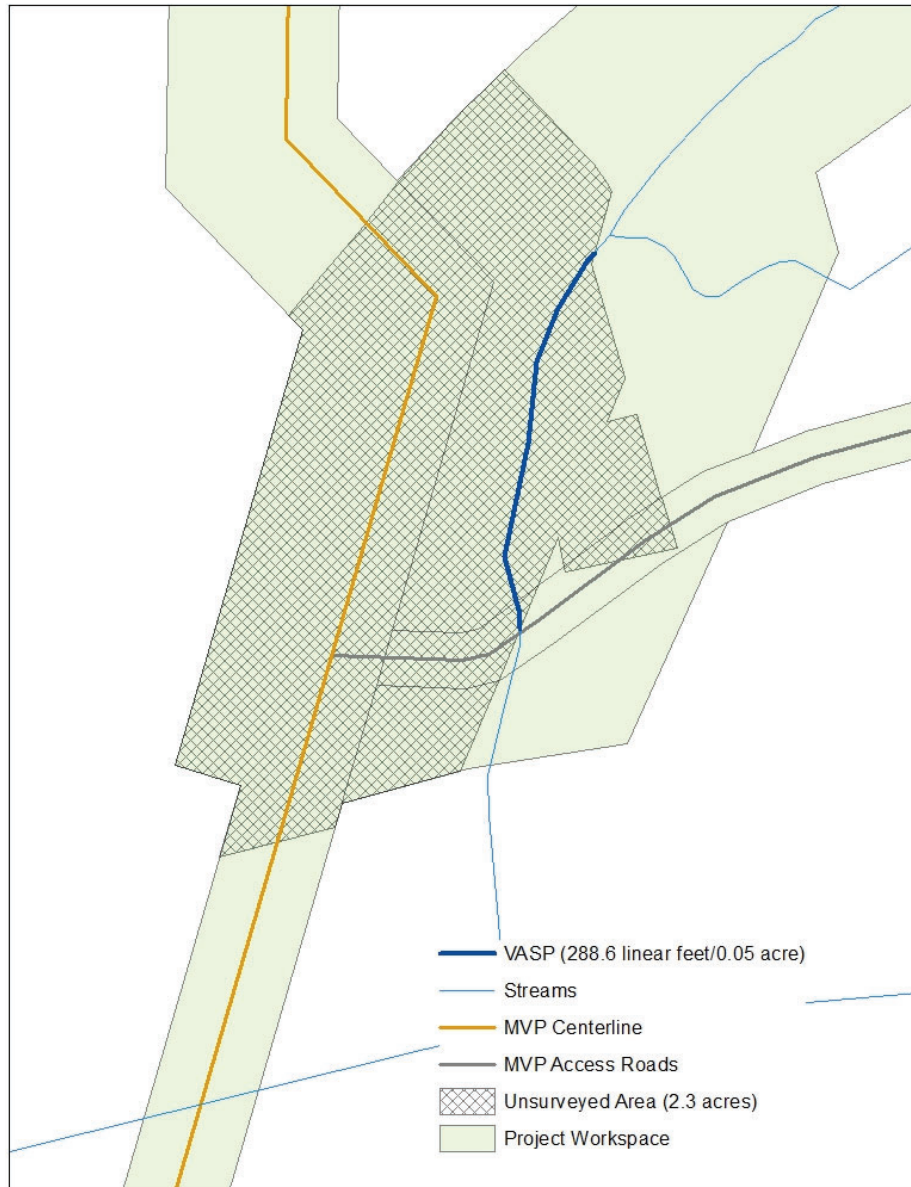
Figure 2. Unserved area and VASP within the construction ROW, ARs, and ATWS.

We are not aware of specific activities that have occurred in the action area adversely affecting VASP. Potential threats within the action area include: invasive species, such as Japanese knotweed ( Fallopia japonica ) and purple loosestrife ( Lythrum salicaria ) that compete with VASP; changes in water flow regimes from weather related factors; and construction of boat docks or other streambank modifications (Service 2008). All of these threats may affect the amount of habitat available for the species along the streambanks in the action area.