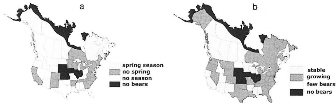
Fig. 1. (a) Hunting season strategies across North America and the associated trend in human–black bear conflicts, 2001. (b) Range of black bear population estimates and growth in North America within associated management strategies, 2001.

respond quickly by reducing harvest objectives as has been demonstrated in some states (New Hampshire; M. Ellingwood, New Hampshire Department of Fish and Game, Concord, New Hampshire, USA, personal communication, 2006).