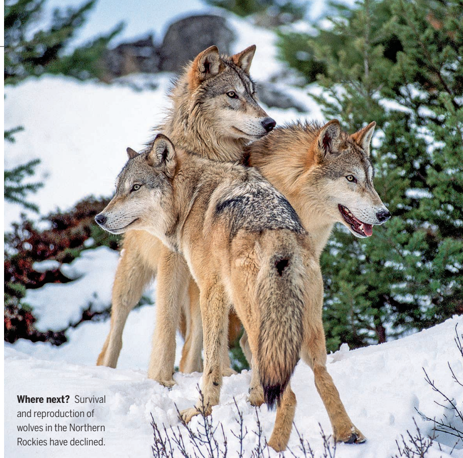
Where next? Survival and reproduction of wolves in the Northern Rockies have declined.