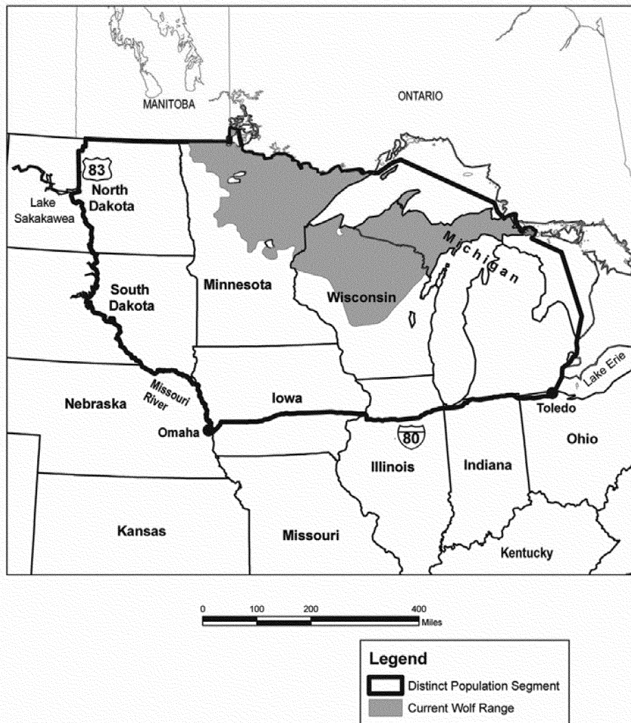
Figure 1. Western Great Lakes Distinct Population Segment