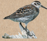
Rock Sandpiper

The National Wildlife Refuge System is the only network of federal land dedicated specifically to wildlife conservation. Home to more than 700 species of birds, 220 different mammals, 250 reptiles, and more than 200 kinds of fish, the amazing variety of wildlife found on refuges reflects America's bountiful natural heritage. Many wildlife refuges were created to protect and enhance the resting and feeding grounds of migratory birds, creating a chain of stepping stones along major migration routes. Others were established to conserve the natural home of our rarest wild species, including bald eagles, bison, and whooping cranes.