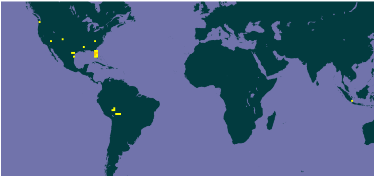
Figure 1. Map of known global distribution of Pterygoplichthys disjunctivus . Map from GBIF (2014).