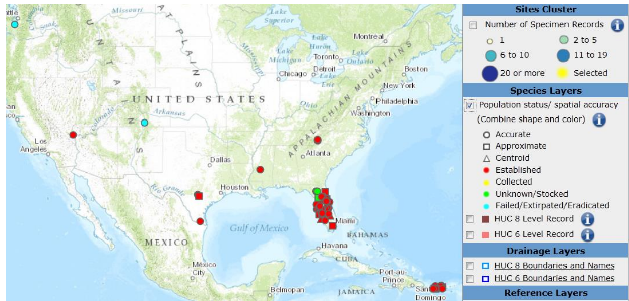
Figure 2. Distribution of Pterygoplichthys disjunctivus in the United States. Map from Nico et al. (2014).