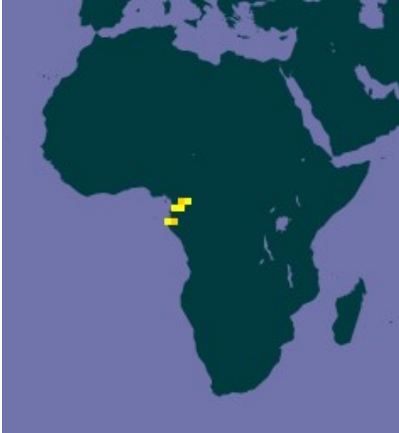
Figure 1. Global distribution of T. nyongana . Map from GBIF (2015).