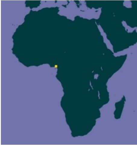
Figure 1. Global distribution of T. kottae . Map from GBIF (2015).