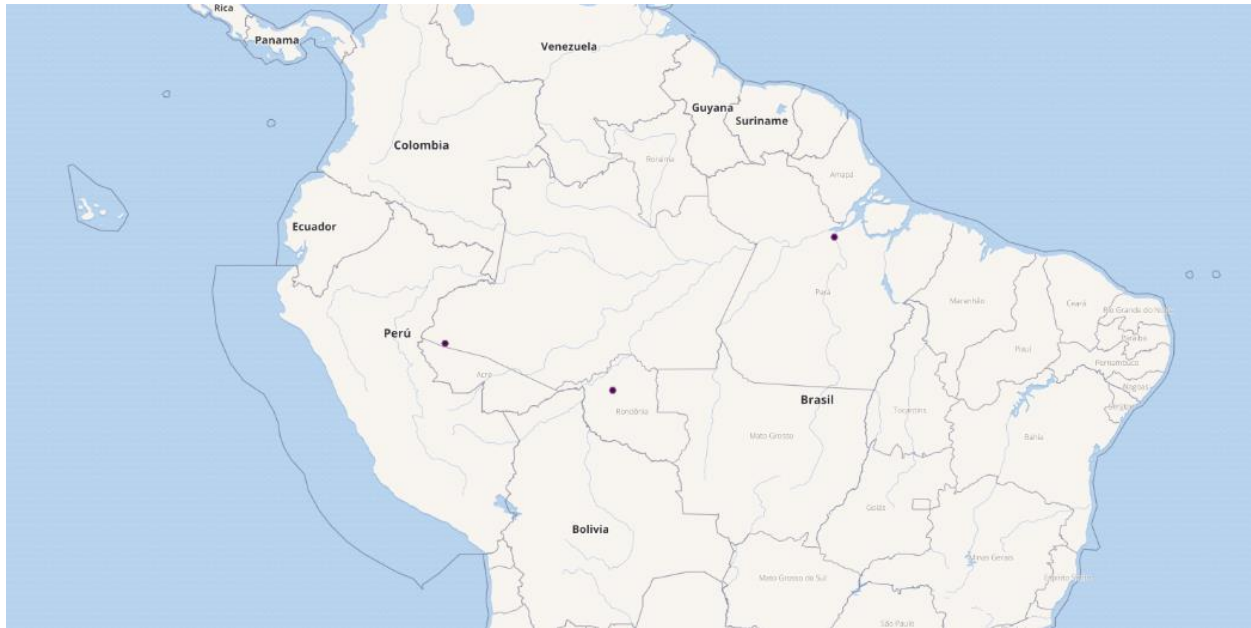
Figure 1. Known global distribution of Brachyplatystoma tigrinum . Locations are all in Brazil. Map from GBIF Secretariat (2017).