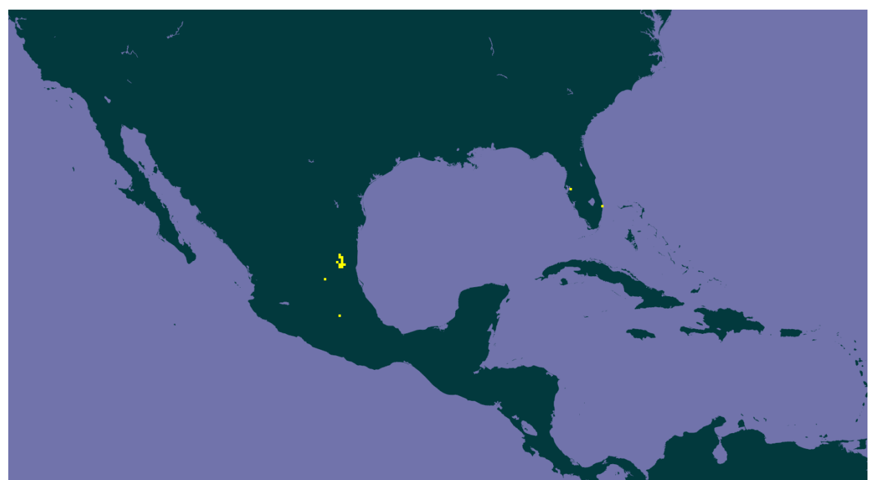
Figure 1. Known global distribution of Poecilia latipunctata . Map from GBIF Secretariat (2016).

The locations in Florida do not represent established populations and were not used as source points in the climate match.