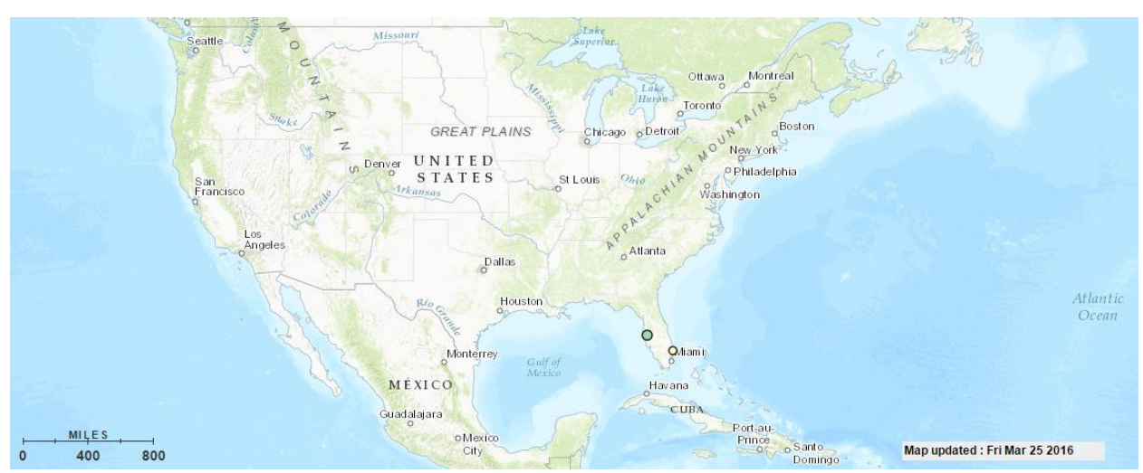
Figure 2. Known distribution of Poecilia latipunctata in the United States. Map from Neilson (2016).

The locations in Florida do not represent established populations and were not used as source points in the climate match.