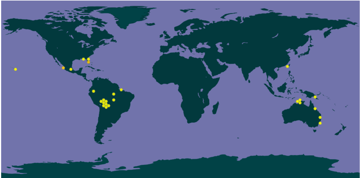
Figure 1. Known global distribution of Pomacea bridgesi . Map from GBIF Secretariat (2017). Occurrences in western Florida, Mexico, Ecuador, northern Brazil, Peru, Taiwan, Australia, and Papua New Guinea could not be confirmed to represent established populations and were excluded from the climate matching analysis. No georeferenced occurrences were available for P. bridgesi established in India.