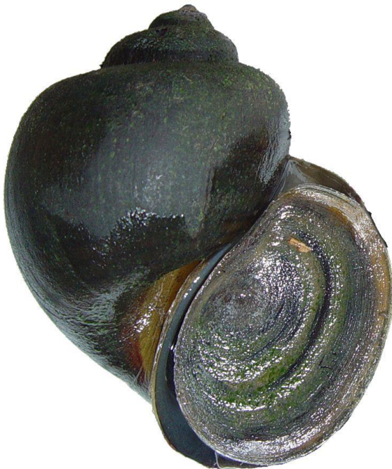
Photo: K. Hayes. Licensed under CC BY-NC 3.0. Available: http://eol.org/data_objects/13234705 . (May 2018).