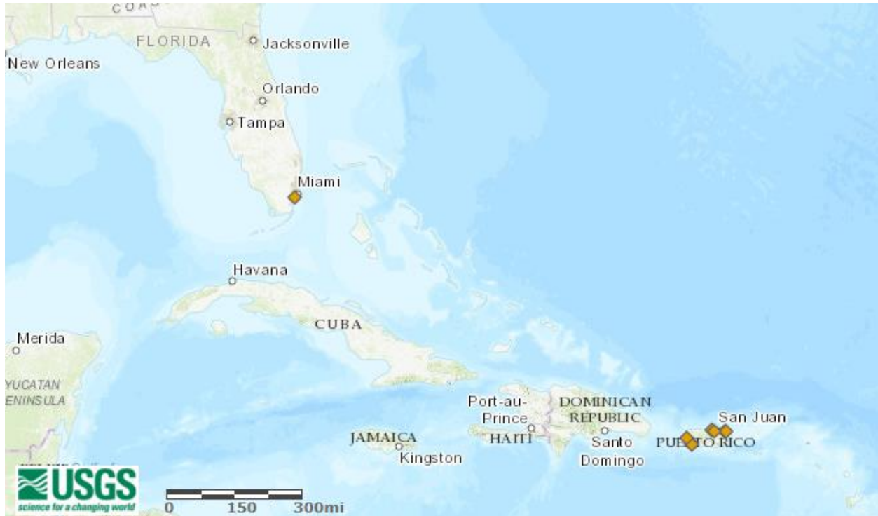
Figure 3. Known distribution of Pomacea bridgesi in Florida and the U.S. territory of Puerto Rico. Map from Benson (2018). Occurrences in Puerto Rico represent established populations; Florida occurrence is of an unknown status according to Benson (2018), although Howells et al. (2006) report that P. bridgesi is established in the county where the occurrence is located. No georeferenced occurrences were available for the established population in Alabama or the occurrences reported from Texas.