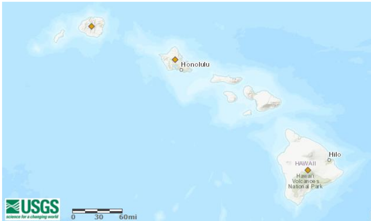
Figure 2. Known distribution of Pomacea bridgesi in Hawaii. Map from Benson (2018). No occurrences represent established populations.