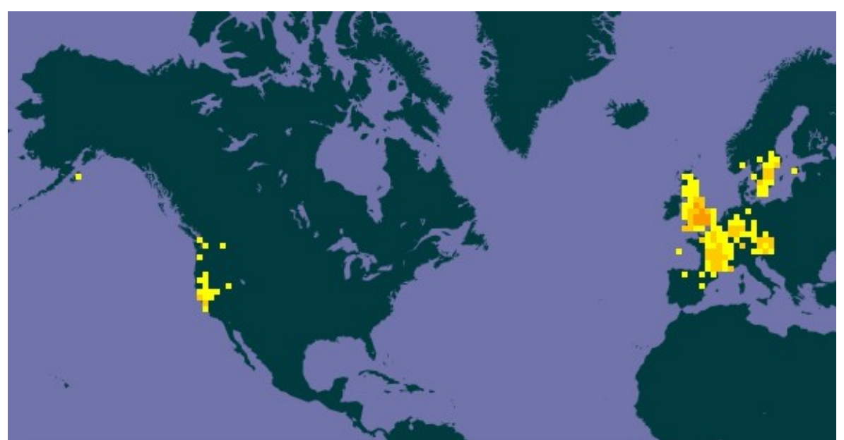
Figure 1. Global distribution of P. leniusculus . Map from GBIF (2015).