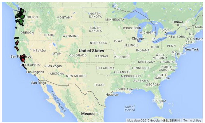
Figure 2. Native (green) and introduced (red) ranges of P. leniusculus in the continental U.S. Map from Fofonoff et al. (2003).