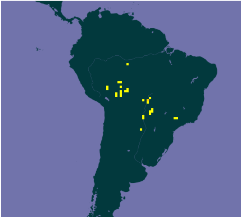
Figure 1. Known global established locations of G. ternetzi . Map from GBIF (2016). Locations in the U.S. and India are not pictured and were not included in the climate matching analysis because they do not represent established populations.