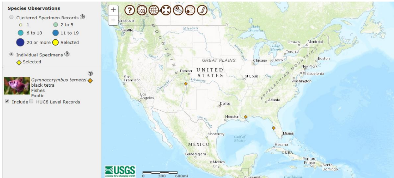
Figure 2. Known U.S. occurrences of G. ternetzi . None of the locations shown represent established populations. Map from Nico and Fuller (2017).