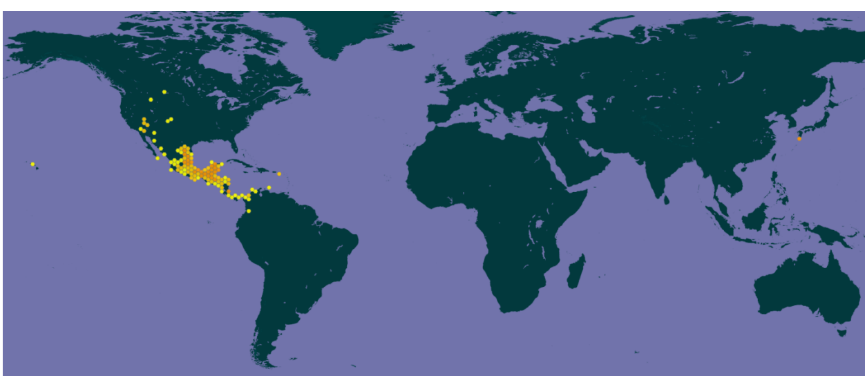
Figure 1 . Known global distribution of Poecilia mexicana . Map from GBIF Secretariat (2017). Occurrences in Brazil were removed due to being museum specimens. Occurrences in the Philippines were removed due to incomplete records and invalid coordinates.