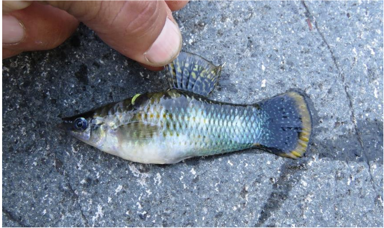
Photo: JGB. Licensed under CC BY-NC. Available: https://www.inaturalist.org/observations/7024871. (December 2017).

U.S. Fish and Wildlife Service, February 2011 Revised, August 2014, December 2017 Web Version, 8/29/2018