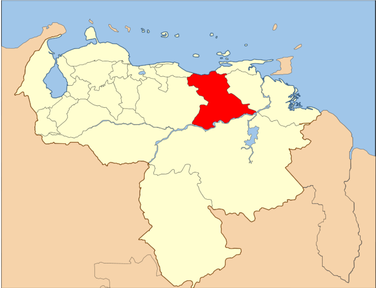
Figure 1. Map of the country of Venezuela with Anzoátegui State highlighted in red. The type locality of Serrasalmus neveriensis has been reported in Fricke et al. (2020) as the Río Querecual, a tributary of the Río Neveri, within Anzoátegui State. Map by Wilfredor. Public domain. Available: https://commons.wikimedia.org/wiki/File:Venezuela_Anzoategui_State_Location.svg (July 2020).