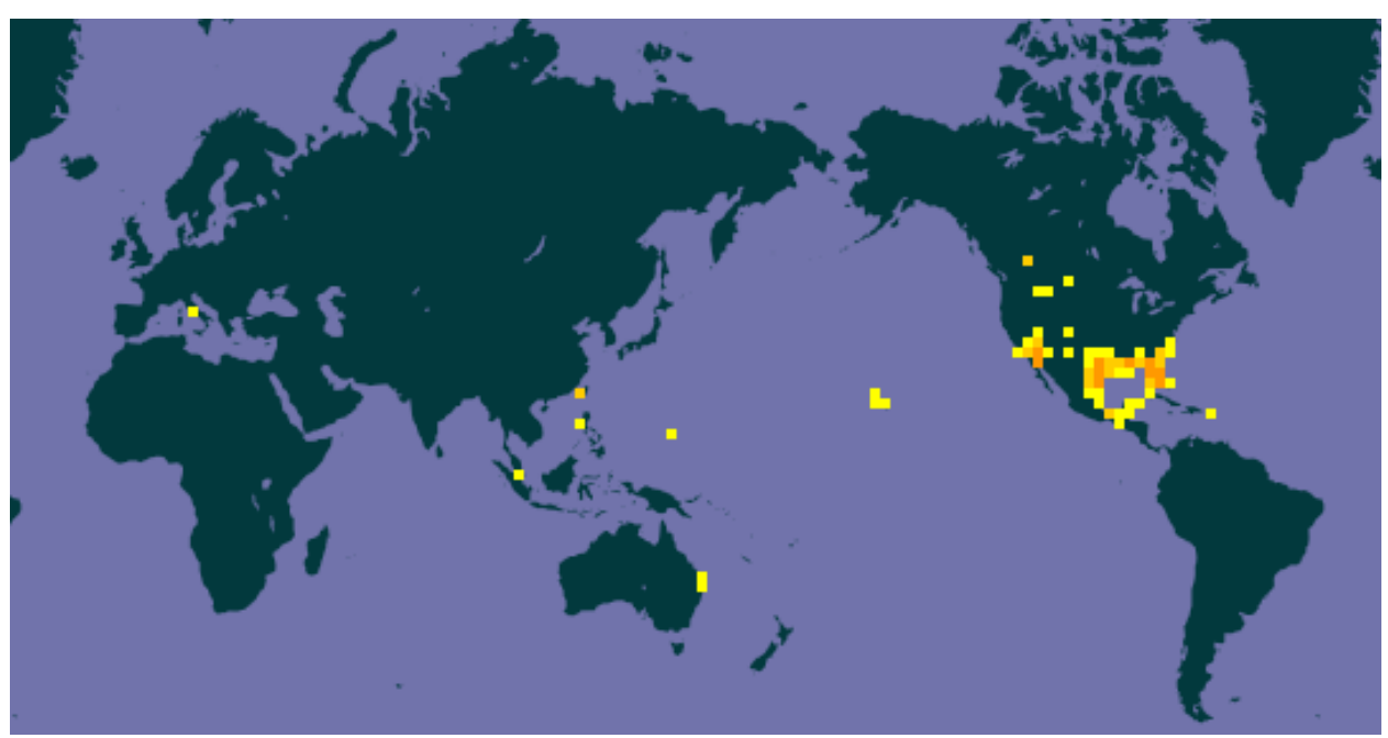
Figure 1. Map of known global distribution of Poecilia latipinna . Map from GBIF (2016). Point in Italy does not represent an established population and was excluded from climate matching. Point in Canada was excluded from climate matching as well; this established population exists in a hot spring environment that is substantially different from the environment represented by nearby climate stations.