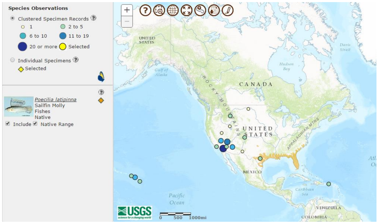
Figure 2. Known distribution of Poecilia latipinna in the U.S. Map from Nico et al. (2017).