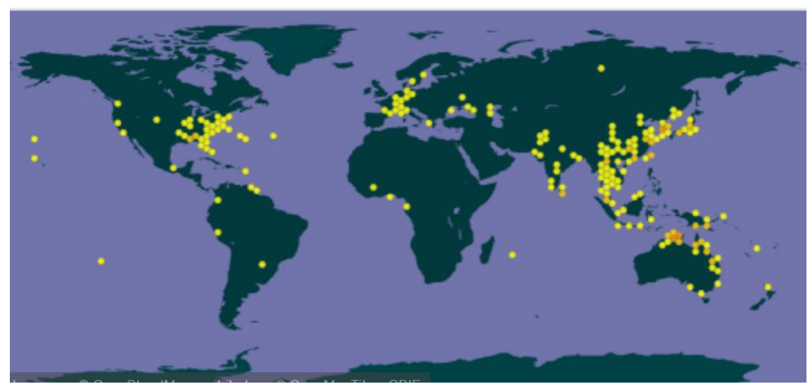
Figure 1. Known global distribution of Nelumbo nucifera . Map from GBIF Secretariat (2019). Localities in Pitcairn Islands, the western United States, France, Hungary, Germany, Greece, Bermuda, Gabon, Benin, Columbia, Peru, and Paraguay could not be confirmed as established and therefore were not used to select source points for the climate match.