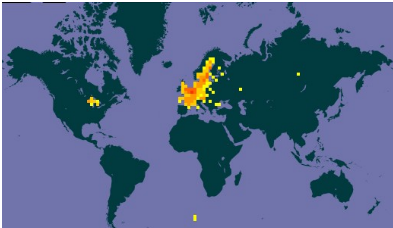
Figure 1. Global distribution of Gymnocephalus cernuus . Map from GBIF (2015). Locations in Mongolia and the South Atlantic were not included because they were incorrectly located.