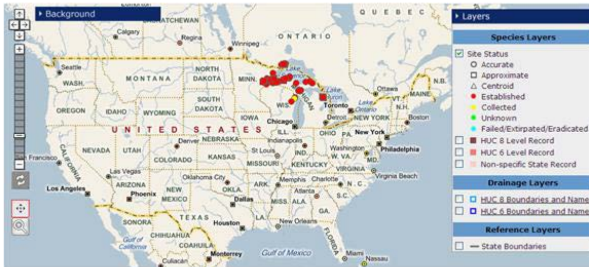
Figure 2. Distribution of Gymnocephalus cernua in the U.S. Map from Fuller et al. (2014).