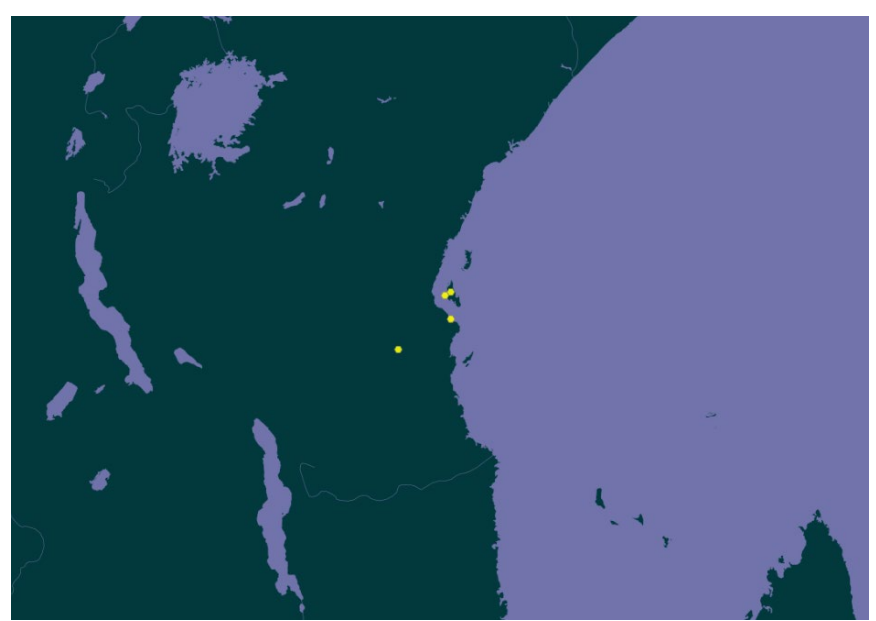
Figure 1 . Known global distribution of Nothobranchius guentheri . Locations are in east Africa (Tanzania) and the island of Zanzibar. Map from GBIF Secretariat (2019). The locations on the mainland were not used to select source points for the climate match as there are no records of populations outside the island of Zanzibar.