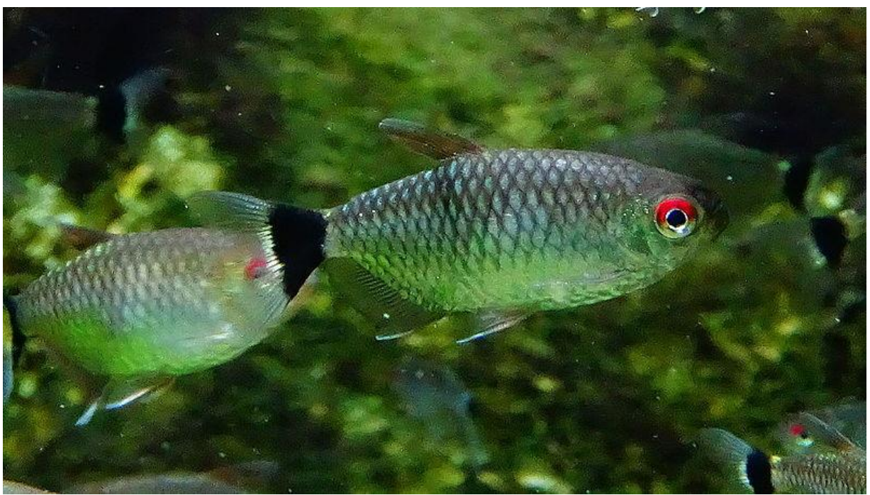
Photo: Loury Cédric. Licensed under Creative Commons Attribution-Share Alike 4.0 International. Available:

U.S. Fish & Wildlife Service, February 2011 Revised, July 2019 Web Version, 11/6/2019