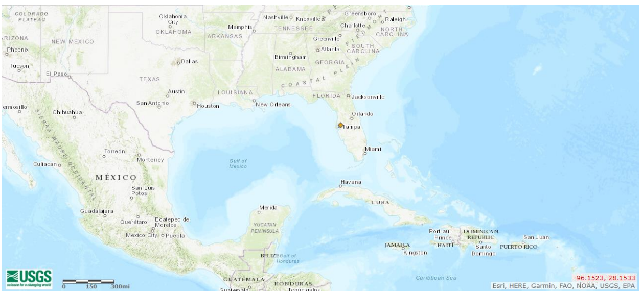
Figure 2 . Known distribution of Moenkhausia sanctaefilomenae in the United States. Map from Nico and Loftus (2019). The observation in Florida was not used to select source points for the climate match as it does not represent an established population (Nico and Loftus 2019).