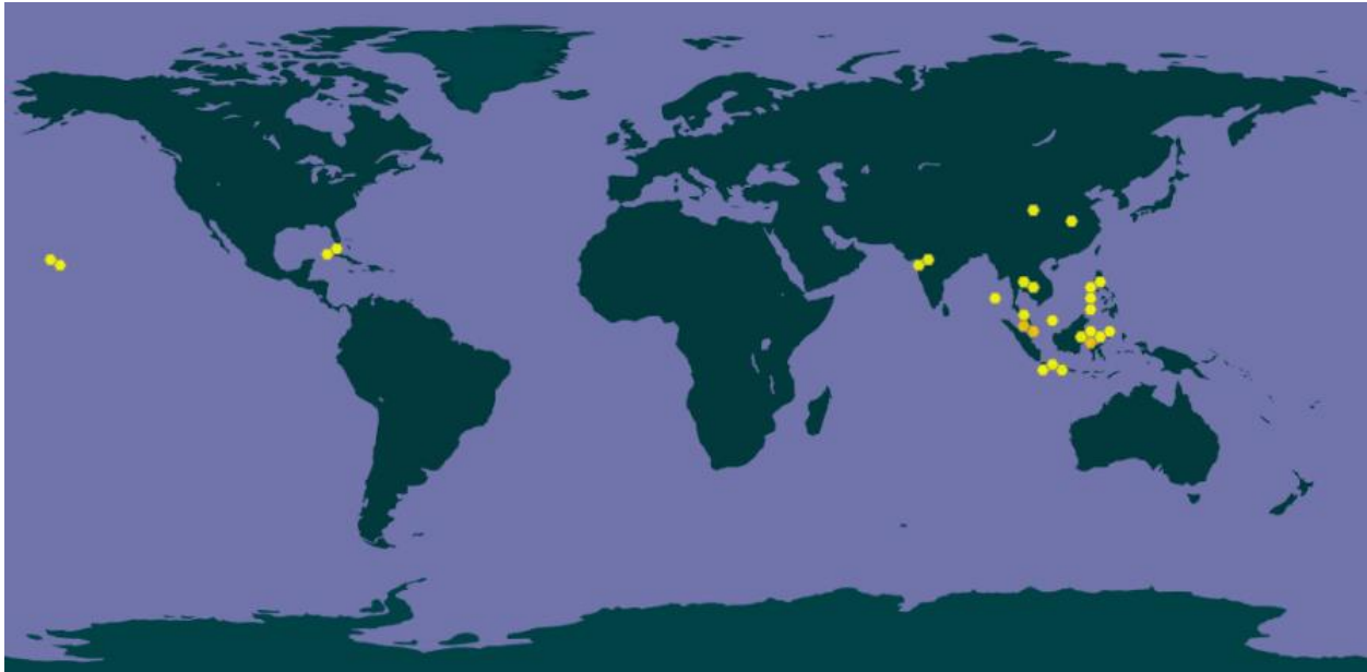
Figure 1. Known global distribution of Pila scutata . Map from GBIF Secretariat (2018). Points in Cuba were excluded from climate match analysis because they did not match any known distribution of P. scutata and were recorded under a synonym which may refer to another species. Points in China were excluded from the climate match analysis because the species presence in that country is doubtful (Joshi et al. 2017). No georeferenced occurrences were available for Myanmar, Laos, or Vietnam.