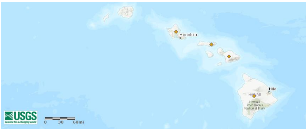
Figure 2. Known distribution of Pila scutata in the United States. Map from Benson (2018). The only confirmed established population is in Oahu (Joshi et al. 2017), so all other locations were excluded from the climate matching analysis.