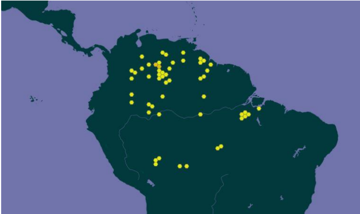
Figure 1. Map of known global distribution of Hydrolycus armatus , reported from South America. Map from GBIF Secretariat (2017).