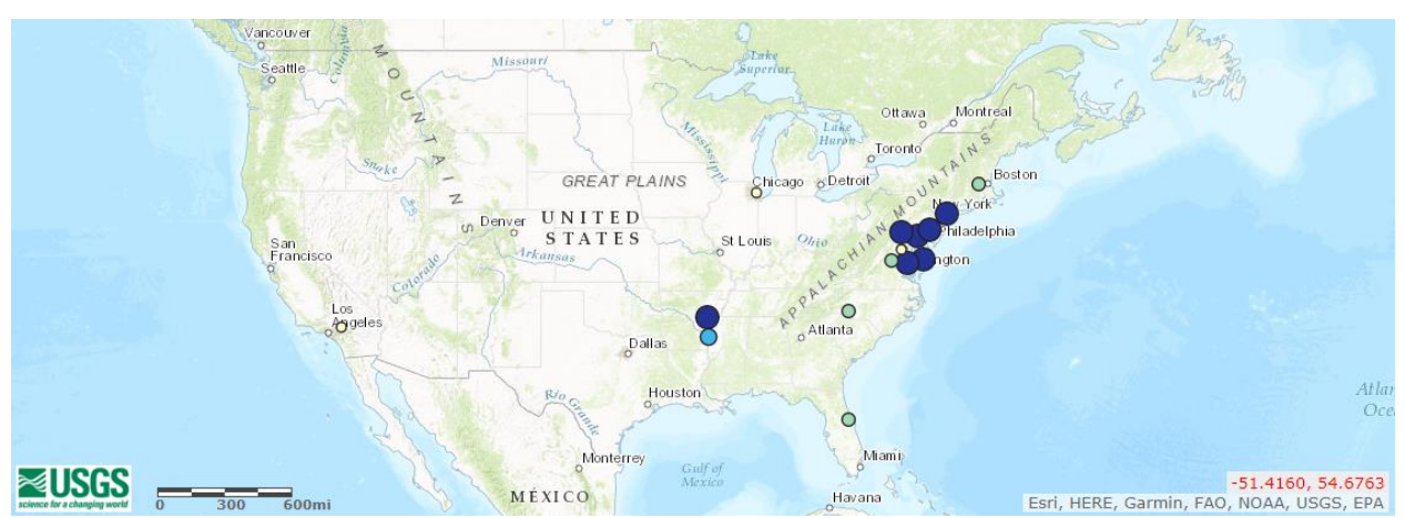
Figure 2 . Known distribution of Channa argus in the United States. Map from Fuller et al. (2017).