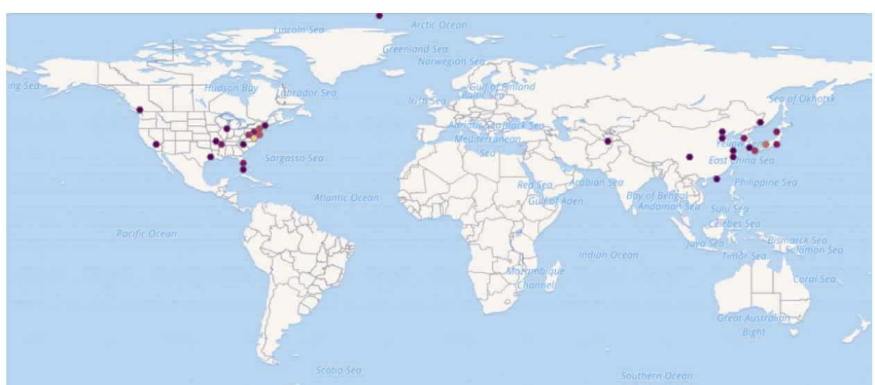
Figure 1. Known global distribution of Channa argus . Map from GBIF (2016).

Only locations of established populations were used as source points for the climate matching analysis. Because they do not represent established populations, locations in Florida, North Carolina, Massachusetts, Illinois, Texas, and California were not included as source points for climate matching (see Section 1). The location in the Artic is marine; C. argus is a freshwater species and the observer requested that the location be marked with uncertainty (GBIF 2016), so the location was not used for climate matching. Finally, the location near Vancouver, British Columbia, Canada is the result of a misidentification; the specimen that was caught was Channa maculata and not C. argus (Scott et al. 2013).