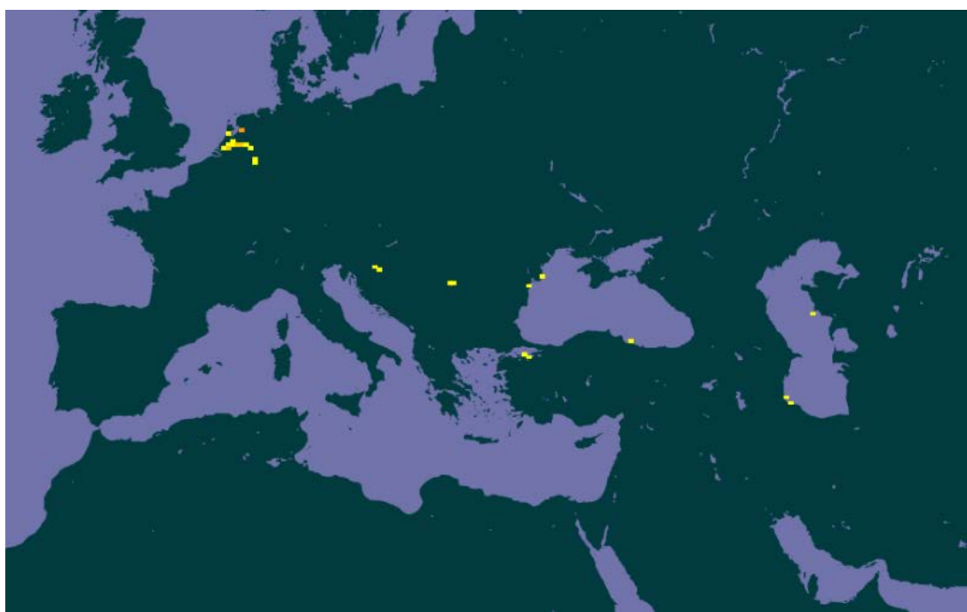
Figure 1. Global distribution of N. fluviatilis . Map from GBIF (2016).