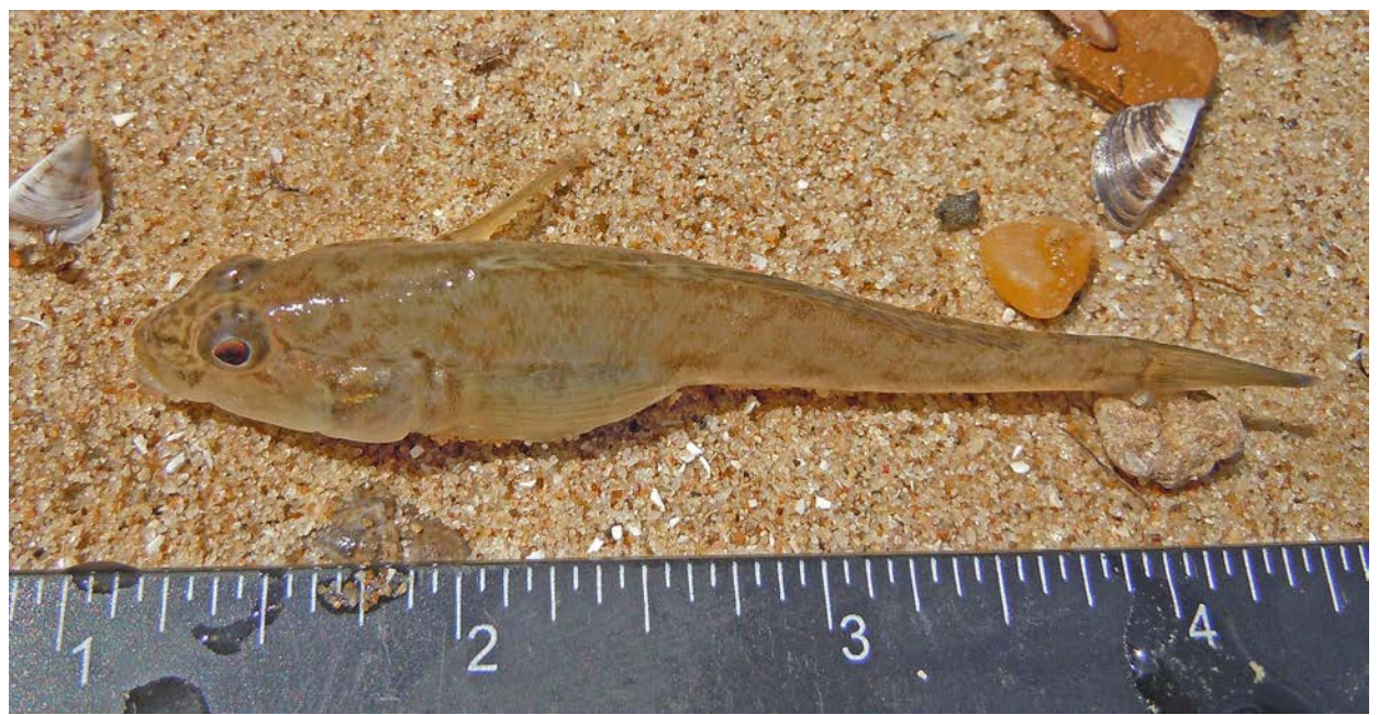
Photo: Yuriy Kvach. Licensed under CC BY-SA 3.0. Available: https://commons.wikimedia.org/w/index.php?curid=15258527. (September 2016).

U.S. Fish & Wildlife Service, February 2011 Revised, September 2016 Web Version, 10/30/2017