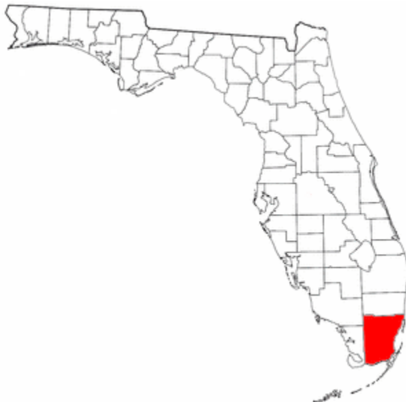
Figure 2. Map of the State of Florida, showing the location of Miami-Dade County, where Procambarus milleri is native. Image: Author unknown. Licensed under Creative Commons CC BY-SA 3.0. Available: https://en.wikipedia.org/w/index.php?curid=7815758 . (May 2018).