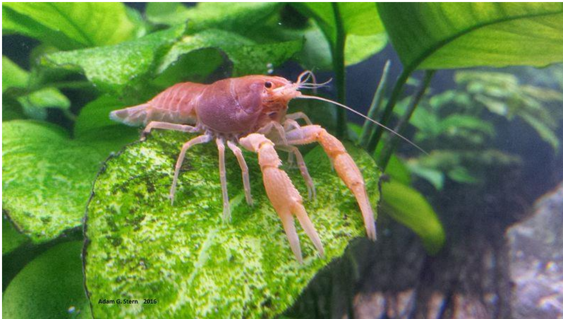
Photo: A. G. Stern. Licensed under Creative Commons, CC BY-SA 4.0. Available: https://commons.wikimedia.org/w/index.php?curid=49113670 . (May 2018).