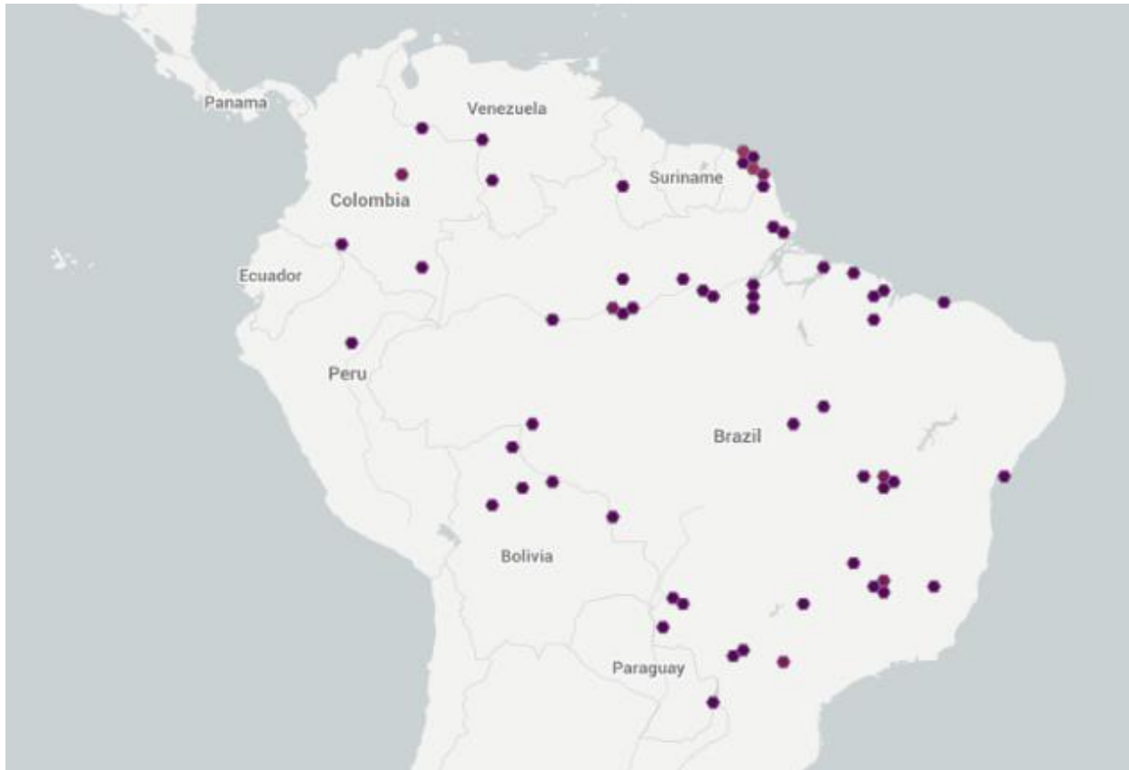
Figure 1. Known global distribution of Metynnis lippincottianus , reported in South America. Map from GBIF Secretariat (2017). Points in the Orinoco River basin (Venezuela and eastern Colombia), east-central Brazil, and Upper Paraguay River basin (near the intersection of Bolivia, Brazil, and Paraguay) were excluded from the climate matching analysis because the establishment status of the species could not be confirmed for those areas.