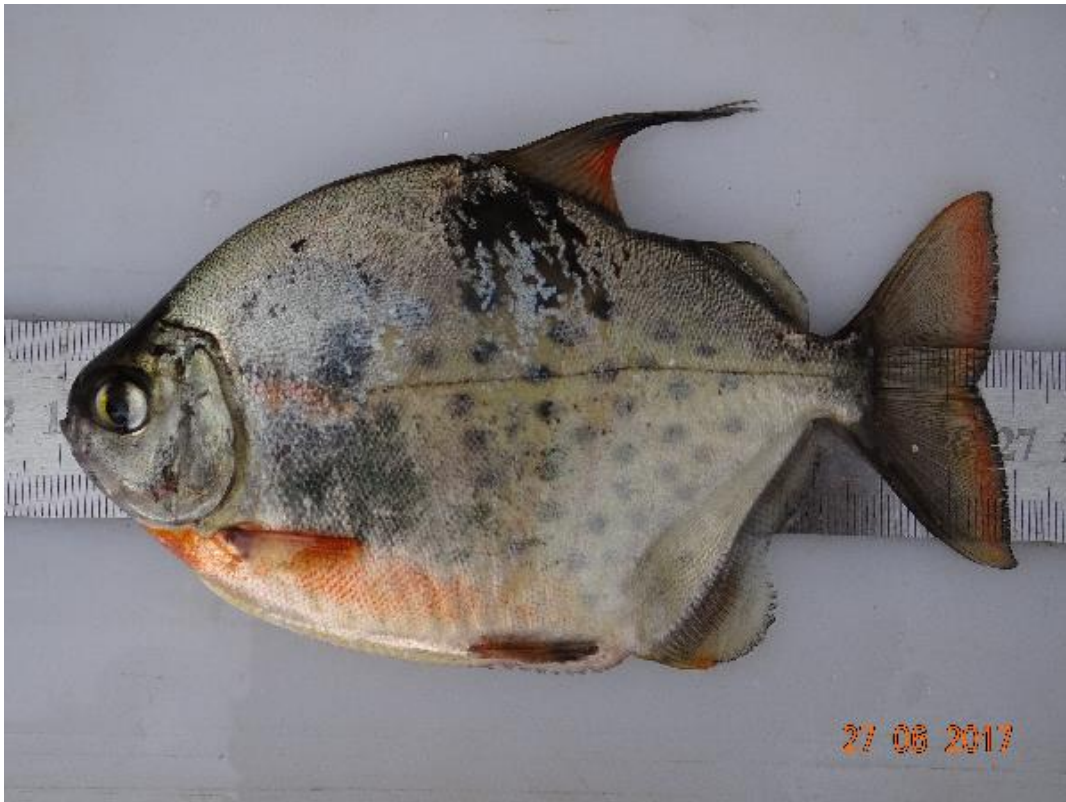
Photo: Metynnis lippincottianus by Lohanny Meira. Licensed under CC-BY 3.0. Available from: http://www.fishbase.org/photos/UploadedBy.php?autoctr=30259&win=uploaded . (January 2018).

U.S. Fish and Wildlife Service, February 2013 Revised, January 2018 Web Version, 8/23/2018